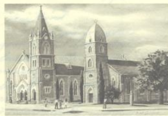
St. Mary's Church Fredericksburg, TX