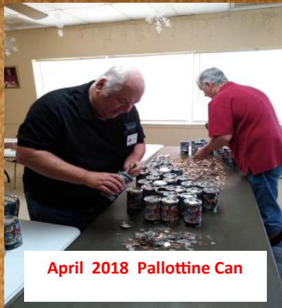
April 2018 Pallottine Can